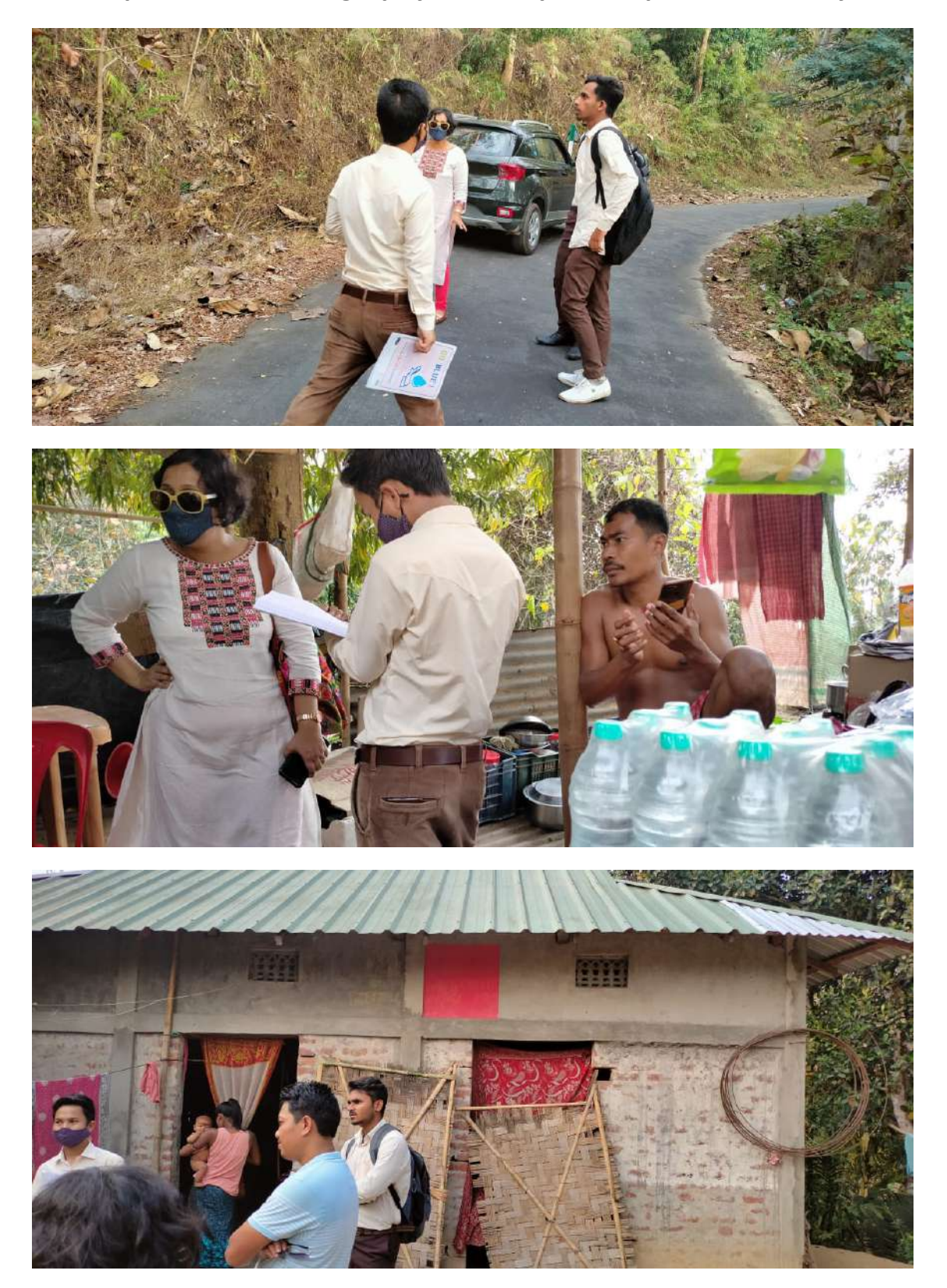
Department of Geography Field Report Preparation Survey