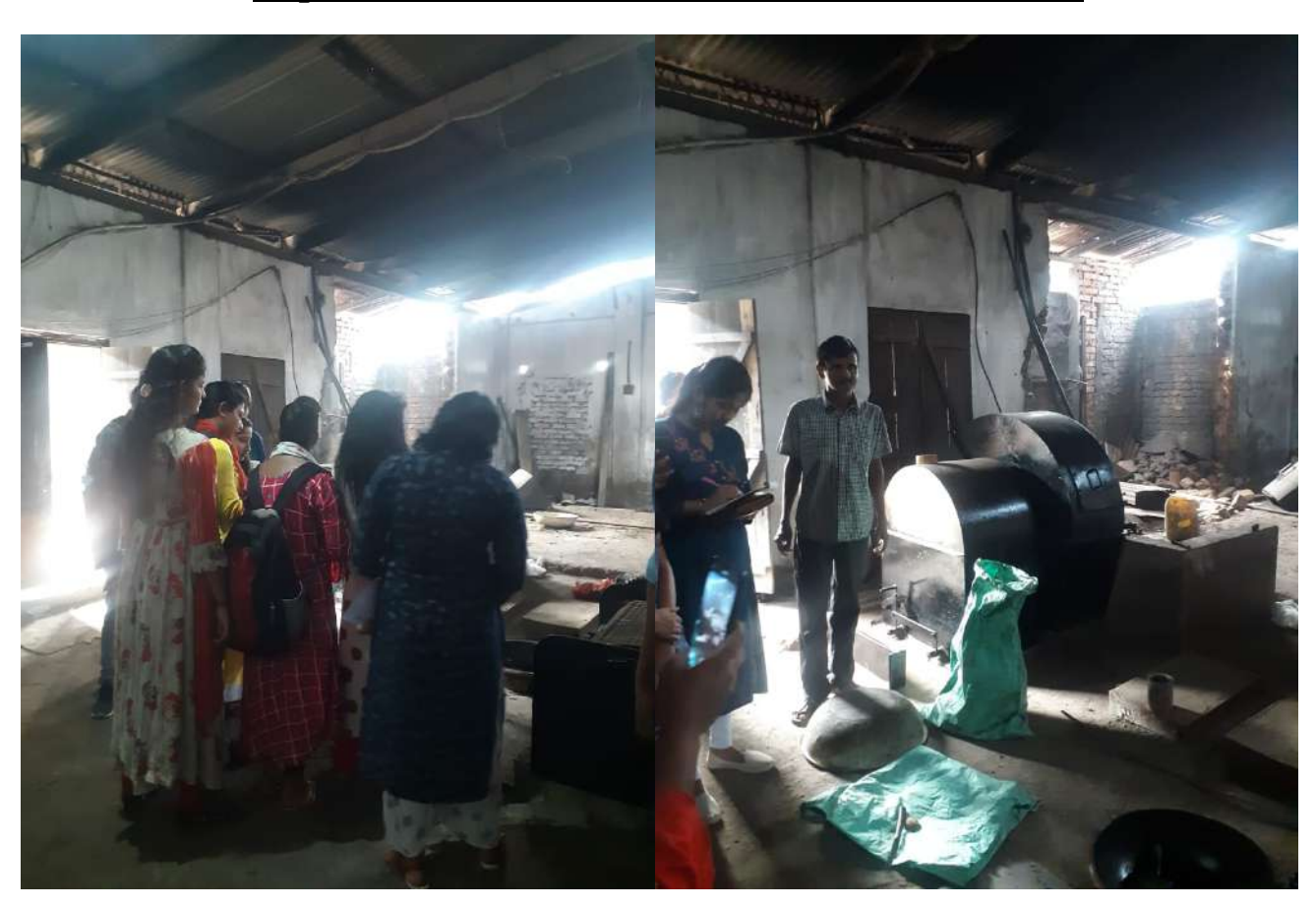
Department of Economics Shoba Tea Estate Visit